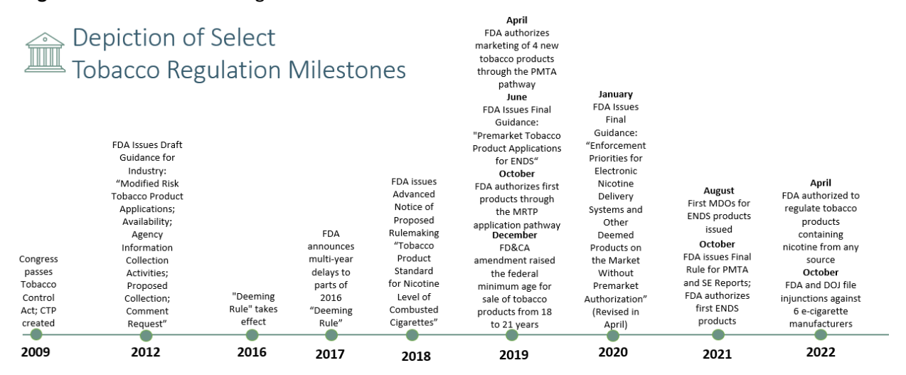
Figure 1: Select Tobacco Regulation Milestones

CTP's stated mission is "to protect Americans from tobacco-related disease and death by regulating the manufacture, distribution, and marketing of tobacco products and by educating the public, especially young people, about tobacco products and the dangers their use poses to themselves and others." CTP describes its work as developing policy, issuing regulations, conducting research, educating Americans on tobacco products, and making decisions on whether new tobacco products and products with modified risk claims can be marketed – including the review and evaluation of applications and claims before the new products are allowed on the market. <sup>21</sup>