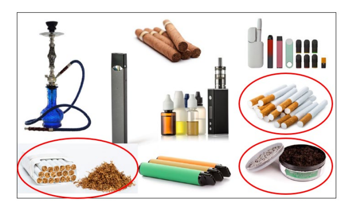
Figure 3: Tobacco Products Regulated by the FDA<sup>23,24,25</sup>

2009 TCA regulated products: cigarettes, smokeless tobacco, cigarette tobacco, roll-your-own tobacco (circled) 2016 Additional deemed products: ENDS<sup>26</sup>, cigars, pipe tobacco, gels, waterpipe tobacco 2022 Products containing nicotine from any source