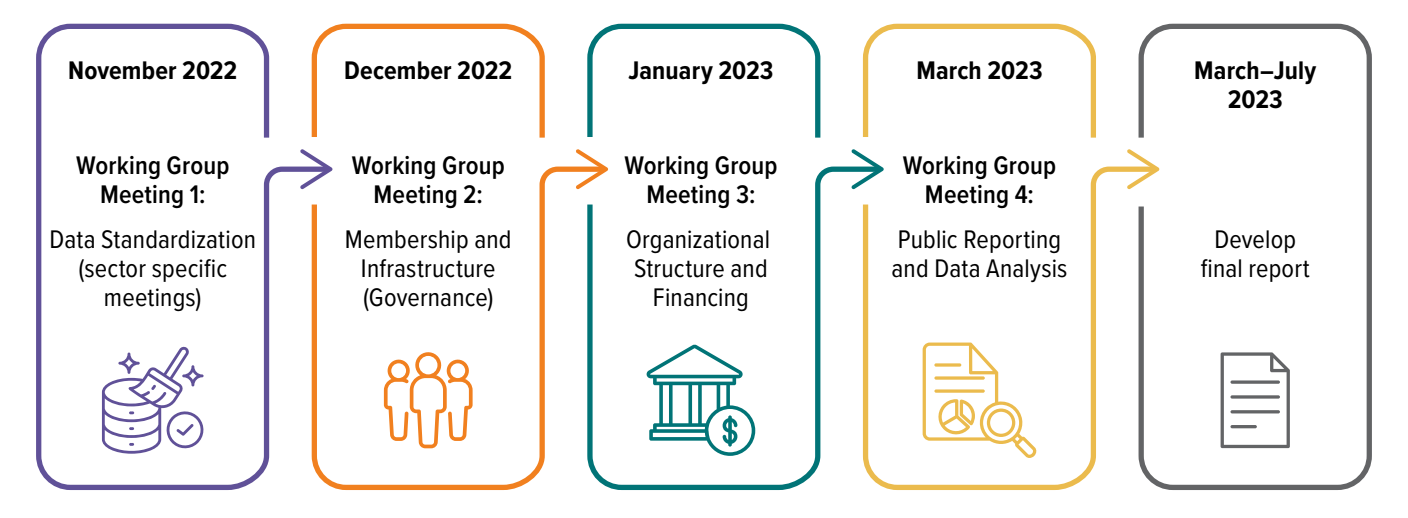
Figure 1: Timeline of Working Group meetings.

Figure 1 shows the timeline of working group meetings. The list of working group participants can be found in Appendix II.